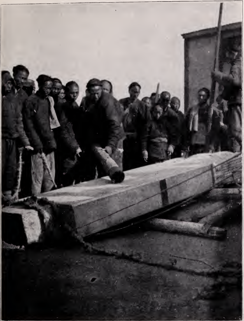
NESTORIAN REPLICA BEING UNLOADED FROM A FREIGHT CAR AT HAN-KOW, JANUARY, 1908.

“The second day of October, 1907, saw, at Sianfu, the fulfilment of an act which ought to have taken place nearly 300 years ago.